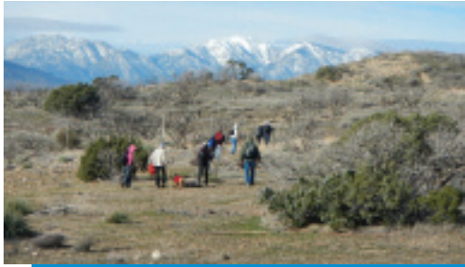
Area being developed.