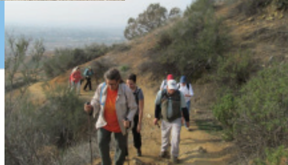
Two above photos of Zanja Peak Hike, January 2016

report for the proposed VOL housing project (8,900 units) on the southern boundary of the San Jacinto Wildlife Area. Contact Riverside County Planner Matt Straite at MSTRAITE@rctlma.org or (951) 955-8631 for more information and to be put on their mailing list.