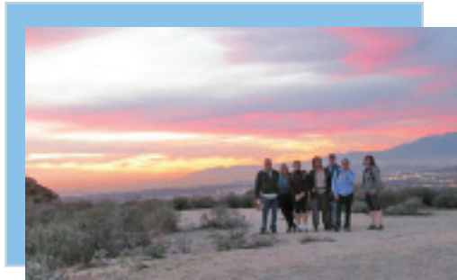
Hiking Terri Peak

Villages of Lakeview (VOL): According to the Riverside County Planning Department there is no release date for the revised, recirculated environmental impact